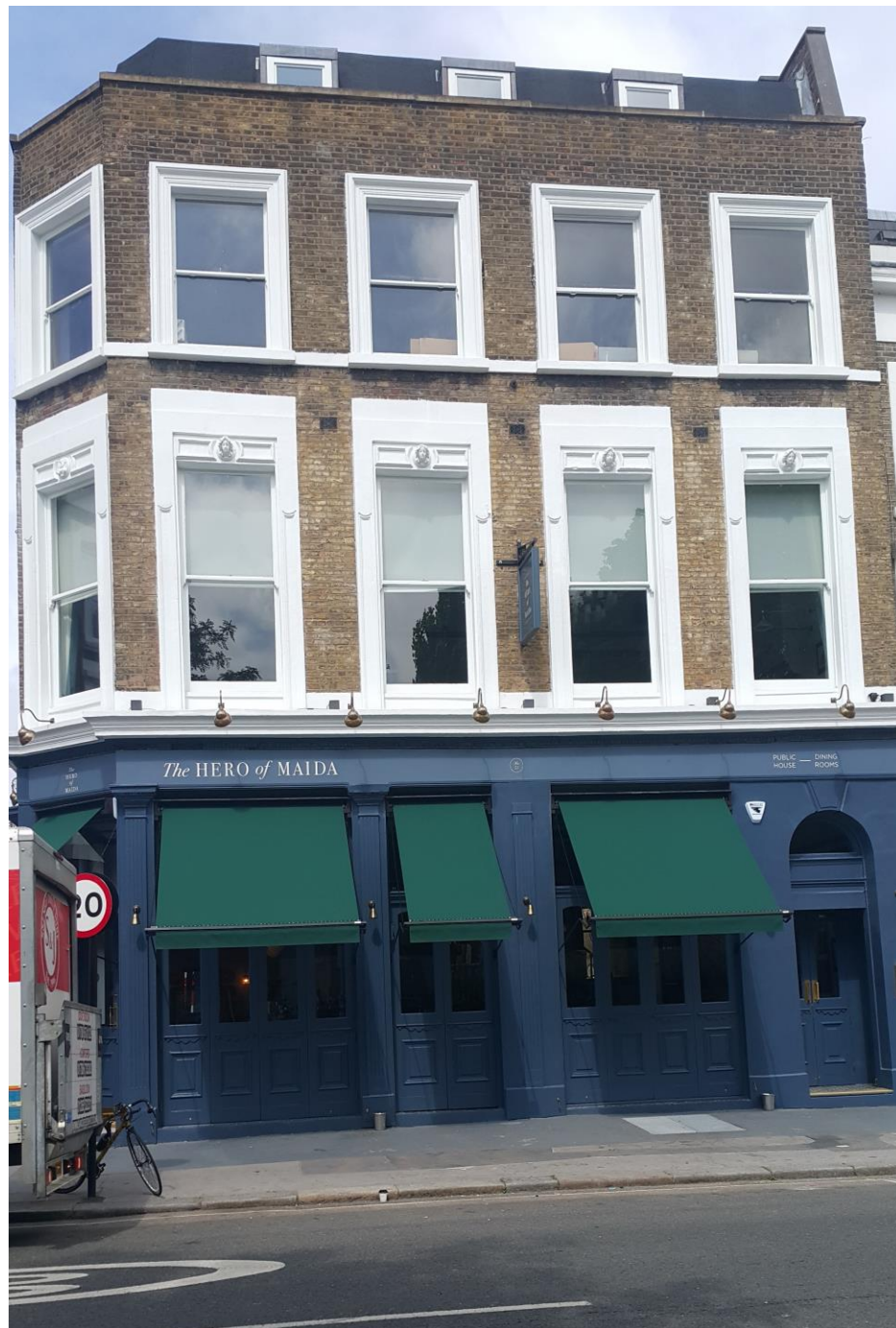
Front Elevation as viewed from Shirland Road